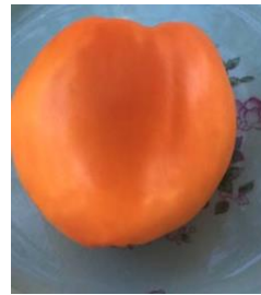
German Golden Strawberry

The regular leaf plants of 'Dester' produce large (six to twenty-four ounce), pink, beefsteak-type, oblate shaped fruits. It is an excellent, tasty slicing tomato.