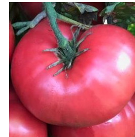
Rosella Crimson - Dwarf

Large Indeterminate, potato, leaf plant produces lots of 1-lb., slightly flattened, pretty, blemish-free, purple-pink fruits with few tomato seeds and excellent flavor. A good choice for slicing into sandwiches, salads or even sauces.