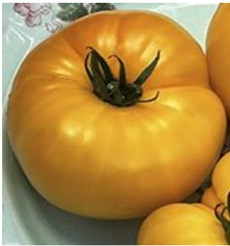
Dagma's Russian Yellow

Large, indeterminate plant produces an abundant crop of beautiful yellow beefsteak shaped 12-14 oz. deliciously sweet tomatoes without the pronounced acidic tang.